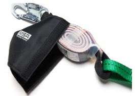
Energy Absorber Cover (Standard & Stretch Lanyard)