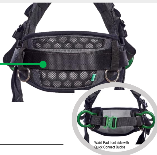
Waist Pad front side with Quick Connect Buckle

The V-FIT Harness' adjustable waist pad allows you to position the waist pad specifically for you and your work day. With its patent pending design. The V-FIT waist pad can be adjusted higher on your torso for lumbar support or lower for work positioning applications. Designed around pressure points and by choosing breathable materials, the V-FIT waist pad delivers ultimate on-the-job comfort.