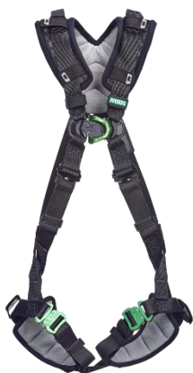
V-FIT, BACK&CHEST D-RING, SHOULDER LOOP, QUICK CONNECT