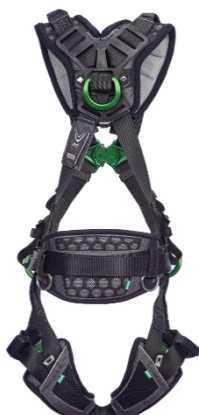
V-FIT, BACK&CHEST&HIP D- RING, SHOULDER LOOP, WAIST BELT, QUICK CONNECT