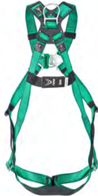
V-FORM, Steel Hardware, Back & Chest D-Ring, Shoulder Loop, Qwik-Fit buckles (P/N 10205379/10205380/10205381)