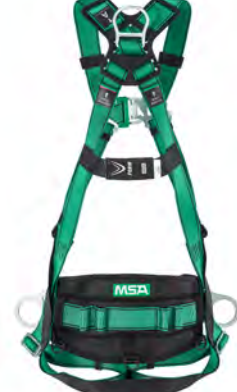
V-FORM, Steel Hardware, Back & Chest & Hip D-Ring, Shoulder Loop, Qwik-Fit buckles (P/N 10205385/10205386/10205387)