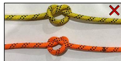
Incorrect use with overhand knot